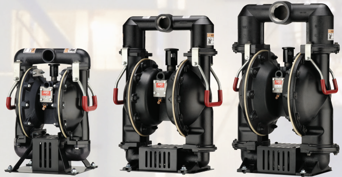
Available in 1-1/2", 2" and 3" port sizes.

ARO® air-operated pumps have been utilized in the mining industry for decades. Their rugged reliability, stall-free operation and convenient portability have made them a fluid handling favorite in every phase of mining operations. These include mud and muck pumping, dewatering, drift dewatering, fuel-transfer, lubrication and more. As part of worldwide Ingersoll Rand, ARO® has the expertise, the technologies, the resources and the performance that is legendary. If your mining operation has a pumping challenge that your current pumps are struggling with...maybe its time you tried a legend: ARO®.