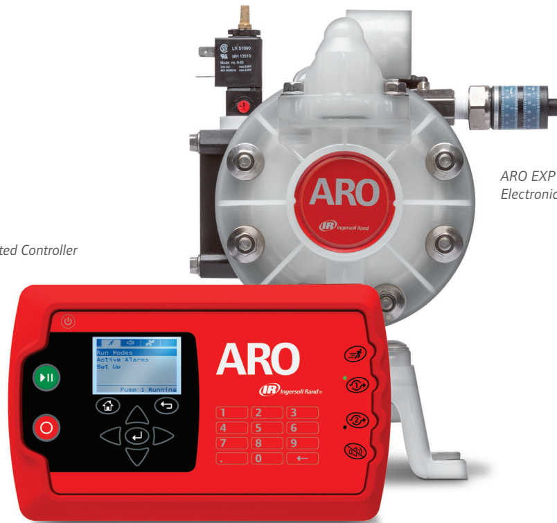
ARO EXP Series Electronic Interface Pumps

“For ARO, it’s not a trade-off between power and simplicity – it’s about producing reliable, flexible equipment that is intuitive and accessible to our customers.”